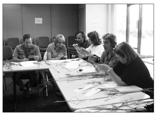
Laguna docents studying grasses in a continuing education class.

Over the 10-week program we explore the wonders of the Laguna, both indoors and out, including visits to special places not open to the public. You will read interesting and stimulating articles, learn about the Laguna ecosystems and its natural and cultural history, interact with the engaging and dynamic Learning Laguna activities, all the while having fun and bonding with fellow trainees and the entire docent circle.