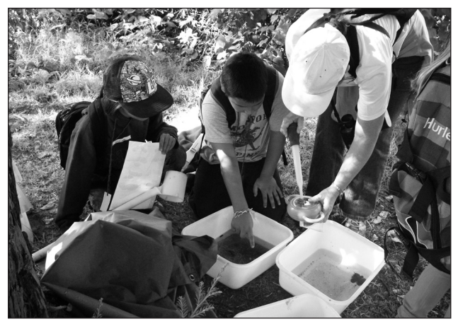
Learning Laguna students learning about aquatic food webs.